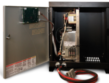
INSIDE VIEW 1