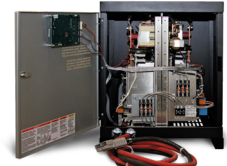
INSIDE VIEW 1