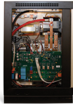
SIDE VIEW Side panel is removable for easy access to components