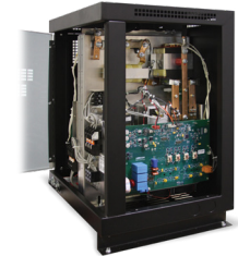
SIDE VIEW Side panel is removable for easy access to components